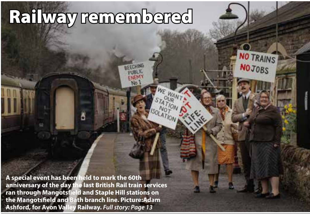
A special event has been held to mark the 60th anniversary of the day the last British Rail train services ran through Mangotsfield and Staple Hill stations on the Mangotsfield and Bath branch line. Full story: Page 13