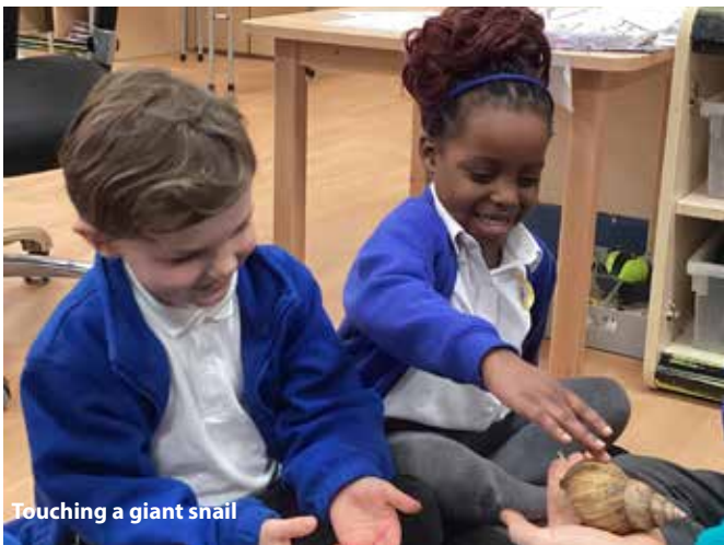
Touching a giant snail