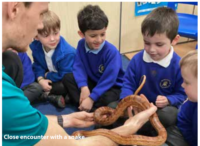
Close encounter with a snake