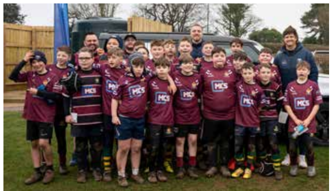
Cleve U12s.