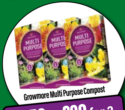
Growmore Multi Purpose Compost