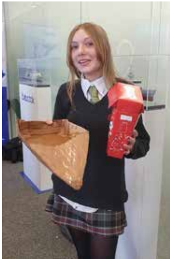
Mangotsfield School students took part in challenges at Babcock International

"The students performed brilliantly, excelling in their bridge designs, which beat many of the other schools' efforts. It was a hugely informative and inspirational day."