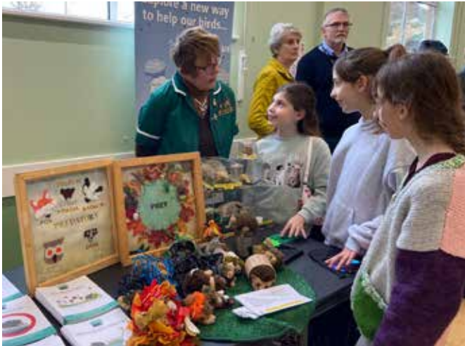
Visitors to the Hedgehog Rescue stall