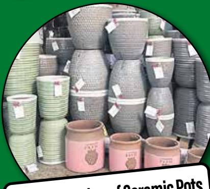
Large selection of Ceramic Pots