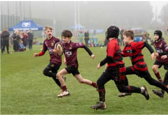
Cleve take on Old Redcliffians