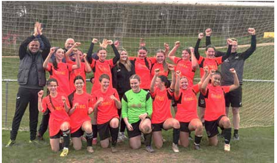
The Downend Flyers U16s Dragons team and coaches celebrating their Division B title.

Meanwhile, in the U15s A Division, our Harriers are locked in a thrilling title race of