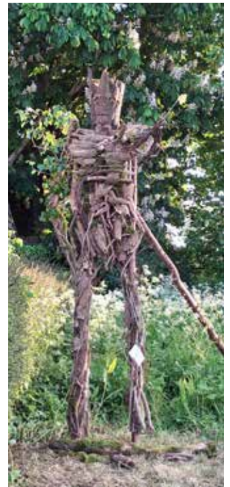
Last year's winning fictional character entry, Groot

There will be a presentation of the answers on May 4 at 3pm in church, with prizes available for the best scarecrow as voted by visitors and also for the most correctly-guessed scarecrow names.