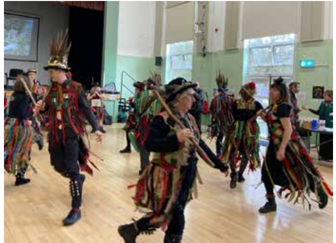
Winterbourn Down Border Morris

There was a tree planting ceremony in nearby Emersons Green Park to mark the end of the Common Connections