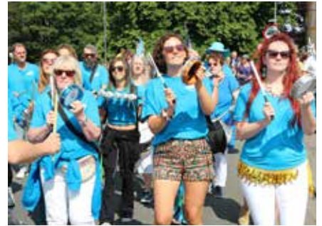
The Sambistas lead last year's festival parade

Anyone who would like to help make sure next year's festival goes ahead can volunteer by emailing chair@mangotsfieldfestival.co.uk or calling 07955 184003.