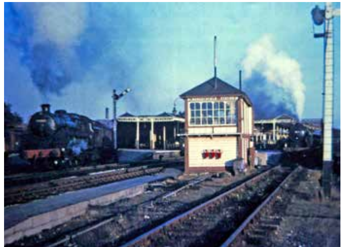
Mangotsfield station in 1964