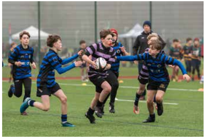
Dings Crusaders take on Clifton

More than 125,000 children have taken part in the Defender Rising Stars Festival since 2008, with some going on to play professionally.