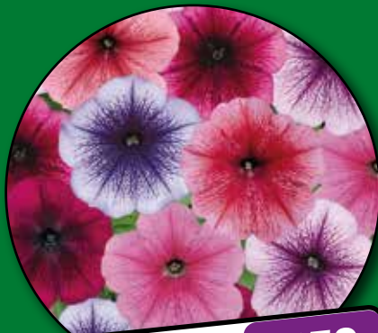
Bedding Plants 20 PLANTS