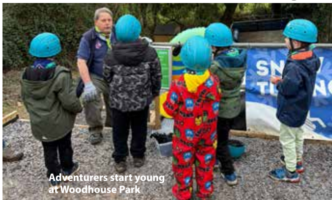
Adventurers start young at Woodhouse Park

Many adults first get involved in Scouting because their children join a group and then they stay because they discover how rewarding it can be.