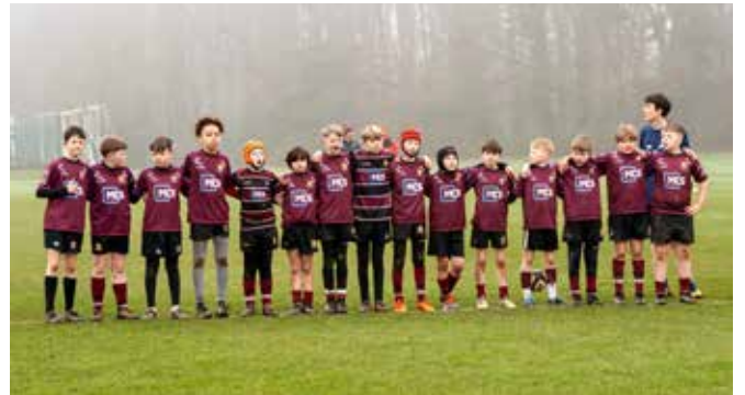
Cleve U11s line up on the pitch