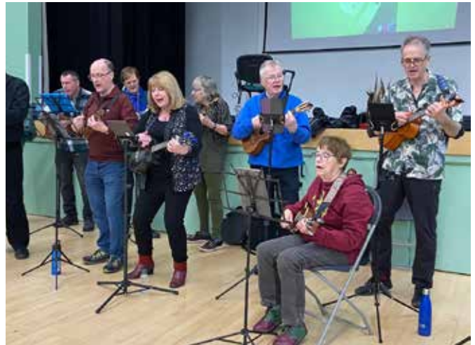
Mangotsfield Ukulele Jam performing