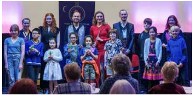
Young performers and professionals together on stage

Work is still under way on the earthworks at each end of the bridge - after they are finished, the contractors will move on to lighting, traffic signals, crossing points and surfacing before the bridge is connected to the A432 and A4174 Avon Ring Road.