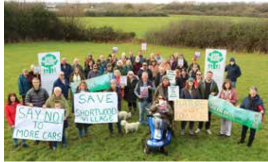
Members of SOGS-SG and residents who protested in January against plans for homes at Shortwood

The group says the council's current plans are flawed because